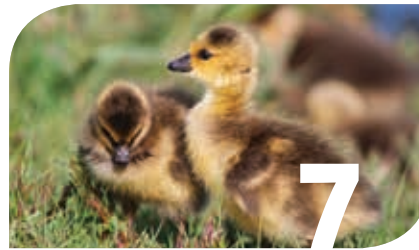
Epidermal and Animal Proteins