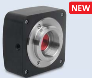
Digital Camera Set USB