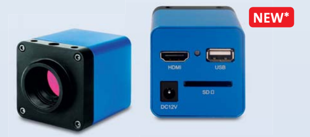
Digital Camera Set HDMI